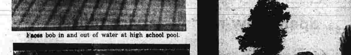
Bathers and serene farmland in the background are honeycombed by the wire fence at Salter's.