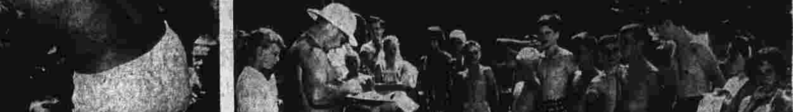
Faces bob in and out of water at high school pool.