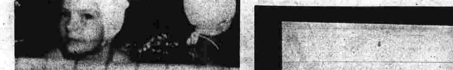
Salter's pool swimmers are framed in bathhouse door.