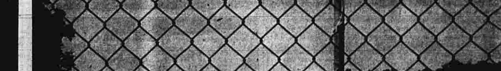
Bathers and serene farmland in the background are honeycombed by the wire fence at Salter's.