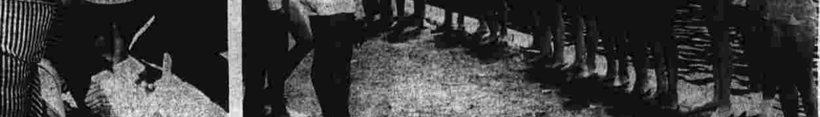
Half in and half out, divers caught in unusual pose.