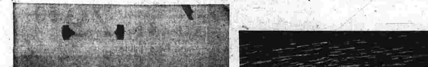
The Recreation Department supervises swimming at Globe Hollow and two other areas.