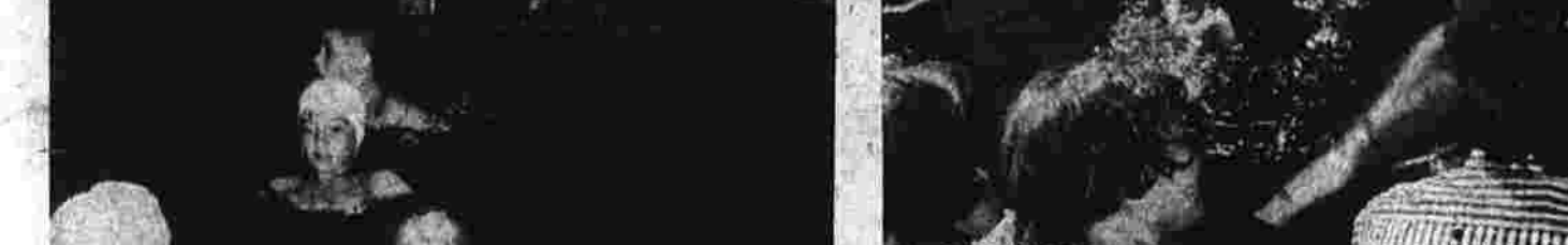
Faces bob in and out of water at high school pool.