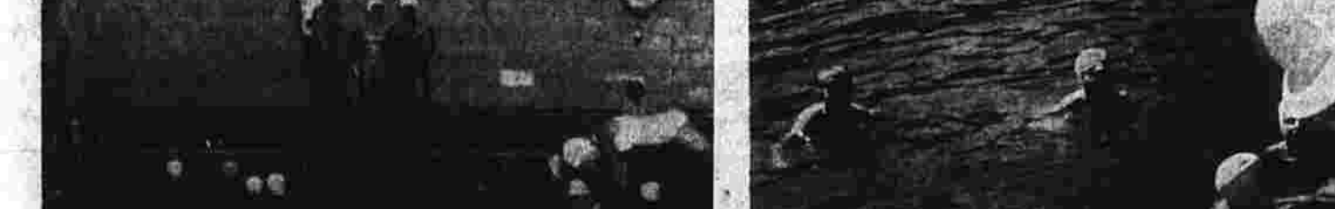
A Globe Hollow instructor shows a group of youngsters the finer points of the crawl.