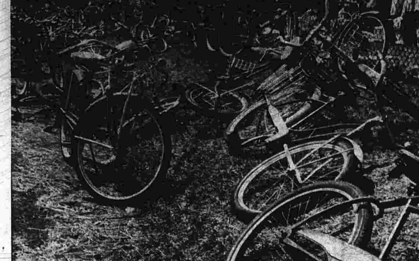
A mass of bicycles, like giant mechanical insects asleep, testify to the popularity of swimming at Salter's.