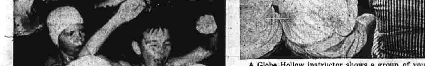
Half in and half out, divers caught in unusual pose.